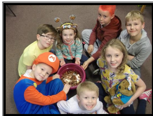
We collected lots of money!